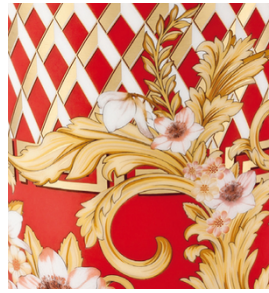
Great detail reproduction on ceramic decals (© Rosenthal) with SEFAR PET 1500