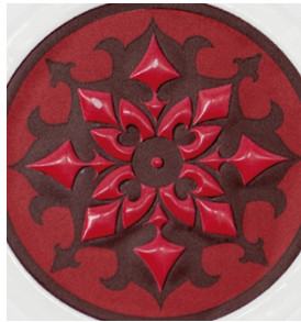
For selected clear varnish on lables, printed with SEFAR PET 1500