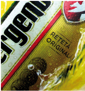
Backlit posters with halftones higher than 30 lines/cm printed with SEFAR PET 1500

SEFAR PET 1500 impresses with its performance in a wide variety of applications, ranging from graphic screen printing in small and large sizes, such as posters, displays, and signage; printing on plastics such as sporting goods, thermoformed parts, etc.; on the decoration of ceramic, directly or indirectly, and on up to textile printing and other industrial printing tasks.