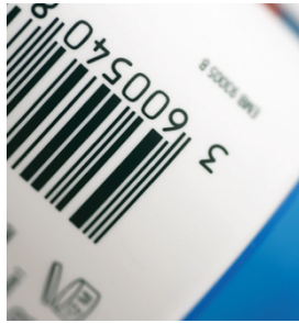
High density sharp edged bar codes printed with SEFAR PA