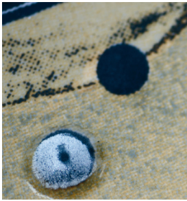
Structured and highly resistant floor tiles with SEFAR PA