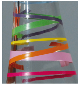
High density and sharp contours with SEFAR PA