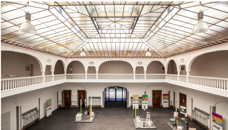
Sefar Competence & Training Center, Screen Printing

The intensive screen printing course covers a wide range of topics, from mesh selection and its impact on the print result, to the intricacies of the stretching process and how to optimize the printing process.