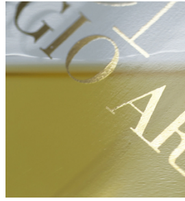
High dense sharp edged letters on perfume flacon with SEFAR PCF FC