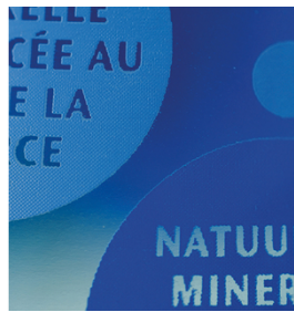
Brilliant colors and crisp print edges with UV inks. Printed with SEFAR PCF 120/305-34Y