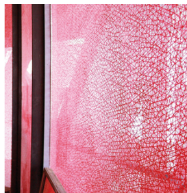
For a precise and durable print image on the glass facade with SEFAR GLASSLINE 68/175-95W