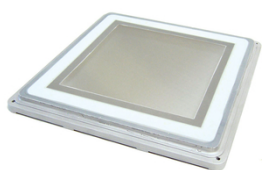
Trampoline Mounted Screen

As our stretched-screen customer, you will also have access to technical support that can help improve the quality of your printing, as well as help your shop push the envelope to take on more challenging projects, and be a technical resource if you should ever have questions.