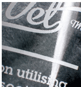
Outstanding printing quality of fine halftones on plastic tubes printed with SEFAR PCF FC