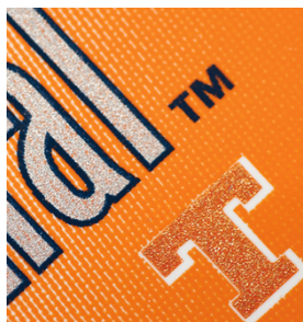
Sharp edged and well readable text on labels printed with SEFAR PCF FC