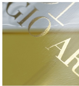
High dense sharp edged letters on perfume flacon with SEFAR PCF FC