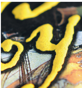
Puff ink applications on garments with SEFAR BASIC

SEFAR BASIC is designed and manufactured for t-shirts, textile and ceramic printing applications.