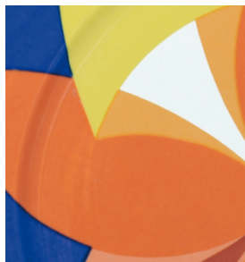
High color density on ceramics with SEFAR BASIC