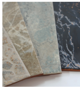
Structured and highly resistant floor tiles with SEFAR BASIC