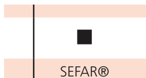
Standard Cyanoacrylate Selection Table

Sefar offers a range of private label cyanoacrylate adhesives for your shop with our SEFAR Mesh Adhesive line (SMA). The availability of low, medium and high viscosity adhesives insures a good match between adhesive and mesh specification. Use with Sefar’s standard activator product, SEFAR Activator.