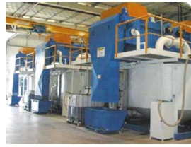
Pressure belt filters