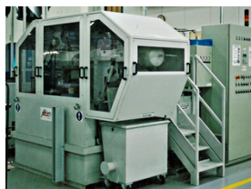
Vacuum belt filters