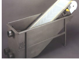
Hydrostatic belt filters