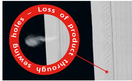
No product loss using Sefar welding technology (no sewing holes)

Sefar has developed dedicated yarns and filter media to withstand strong alkaline process conditions at operating temperatures up to 110 degrees Celsius. Our multichannel bags feature highly uniform dimensions thanks to an automated fabrication process from cutting to welding and channel sewing on a special sewing automate. Special thread is used for sewing and a highest-class fabric allows for smooth installation and perfect tightness on the collector.