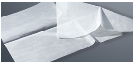
■ SEFAR MEDIFAB